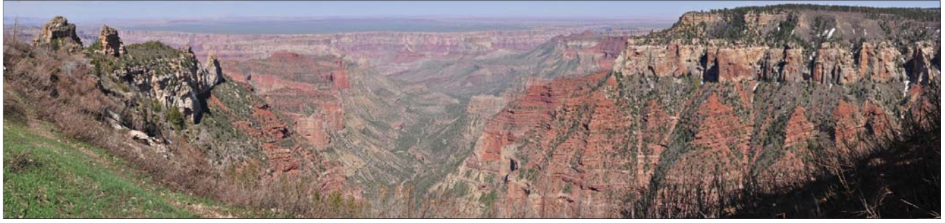
View from Roosevelt Point