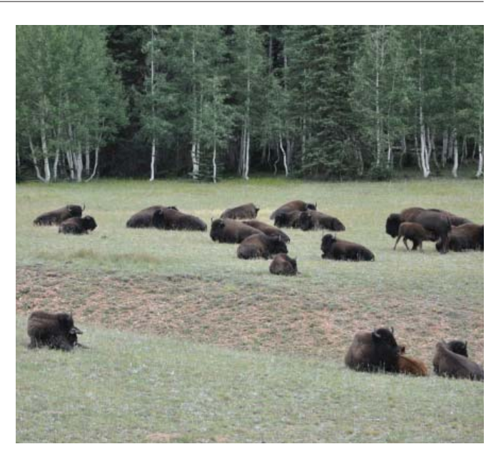
Bison in the Little Park Meadow adjacent to the North Rim Entrance Road.